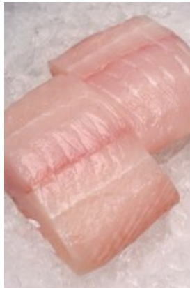
Halibut Fillets $24.99 at Pike Place Market, Seattle

The fact is, if you take the cost of transportation to the Highliner Lodge out of the equation... our guests' trips are completely paid for by the fish that they take home!