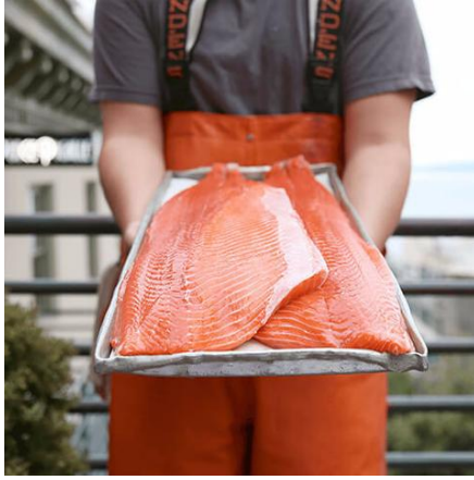
King salmon Fillets $37.99 - Silver salmon Fillets $19.99 at Pike Place Market, Seattle