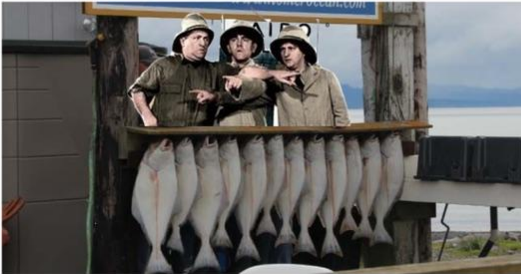
These sport fishers proudly display their catch in Homer, AK.

See Shep, Moe and Curly fight over their little halibut, the only ones they could keep at XYZ Lodge!