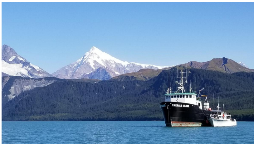
THE EMERALD ISLAND & BURNING DAYLIGHT AT LITUYA BAY SEPT 2019