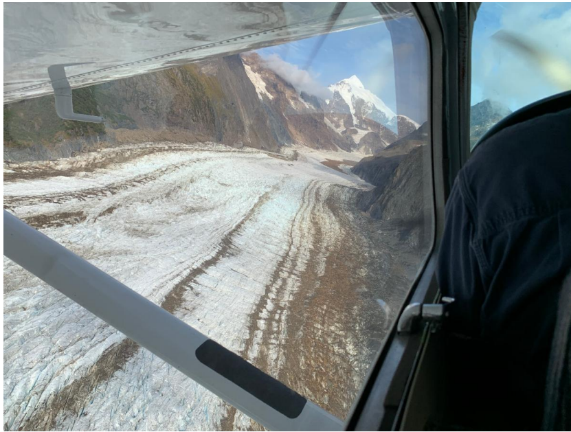
VIEW OF ONE OF THE GLACIERS FROM THE SEAPLANE

seeing trip at the base of Mt Fairweather and over several glaciers and along the outer coast! It was spectacular!!