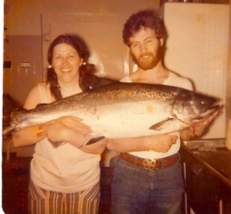
"My" First king Salmon (Well, OK, my mom caught it and gave it to me... 45 years ago!)

To be clear to those who think I have a political "agenda"... I do! That agenda is to make the Highliner Lodge the best fishing lodge in all of Alaska and to promote what I can prove is the best fishing lodge in all of Alaska! I do have opinions, and they are strongly held... however, knowing that they are mine based on my own peculiar 66 years experience, I recognize that your opinions are likely to be different than mine. As an American, I am proud to say that I support your right to disagree with me on any issue.